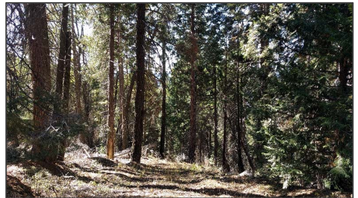
One possible building site

5 acres Two possible driveway locations Roughed in driveway at the NE corner of the property Water, electricity, and cable Internet/TV are available Located on a private road off of Redwood Dr. between Alpine Village and Sequoia Crest